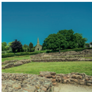
Letocetum Roman Site