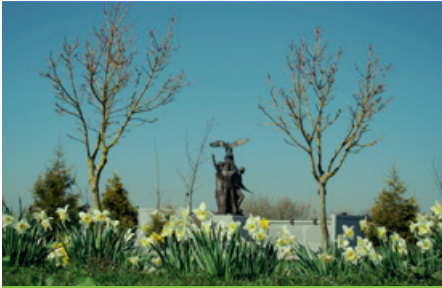
National Memorial Arboretum

If exploring the great outdoors and getting closer to nature is your idea of the perfect getaway, there is no shortage of green space in Lichfield District.