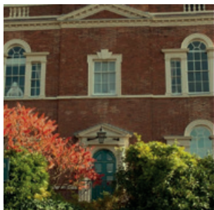
Erasmus Darwin House

Learn about St Chad and so much more when visiting the stunning Lichfield Cathedral , the only medieval English cathedral with three spires. Then, call into Erasmus Darwin House , where you can learn about Charles Darwin's grandfather, who was himself a scientist, philosopher, poet and physician.