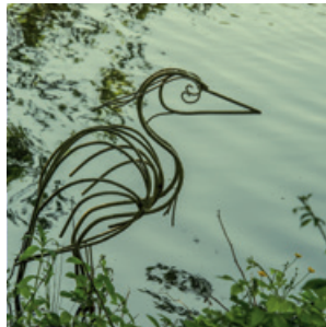
Fradley Nature Reserve