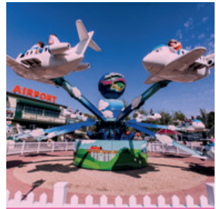
Drayton Manor Theme Park

Still got energy to burn? Book a few laps of the track at Midland Karting . A morning whizzing around in a go kart will definitely wake everyone up! After a spot of lunch, explore the parks and playgrounds in Lichfield city centre, including Beacon Park and Stowe Pool , and enjoy our family friendly attractions.