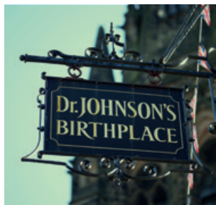
The Samuel Johnson Birthplace Museum

Lichfield District is rich in history, with its Roman settlement, medieval architecture, Georgian museums, Civil War battles and much more. Whether you want to dive into a particular period or explore the scope of Lichfield's heritage, there are some fascinating stories to discover.