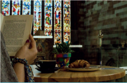
The Hub at St Mary's

We all deserve a treat, so book yourself a short break and spoil yourself rotten! We've got everything you'll need, including some wonderful hotels for a luxury break.