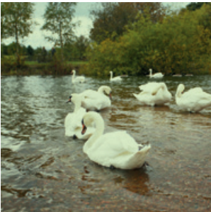
Chasewater Country Park

Chasewater Country Park is a short drive from Lichfield city centre. The 90 hectare reservoir and surrounding nature reserve, which is all a protected Site of Special Scientific Interest (SSSI), is a wonderful place to explore or enjoy water sports.