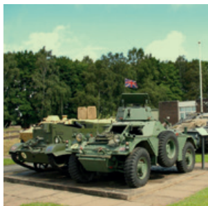
Staffordshire Regiment Museum

Stop off at The Samuel Johnson Birthplace Museum and uncover the life and times of Dr Johnson, renowned author of A Dictionary of the English Language , first published in 1755.